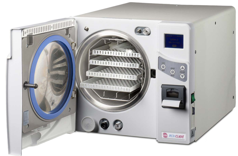
18 Litre Model with Printer

SD Memory Card Data Logger - Fitted with an SD memory card slot as standard to record Cycle Data. Data can be transferred to compatible PC/MAC with memory card slot.